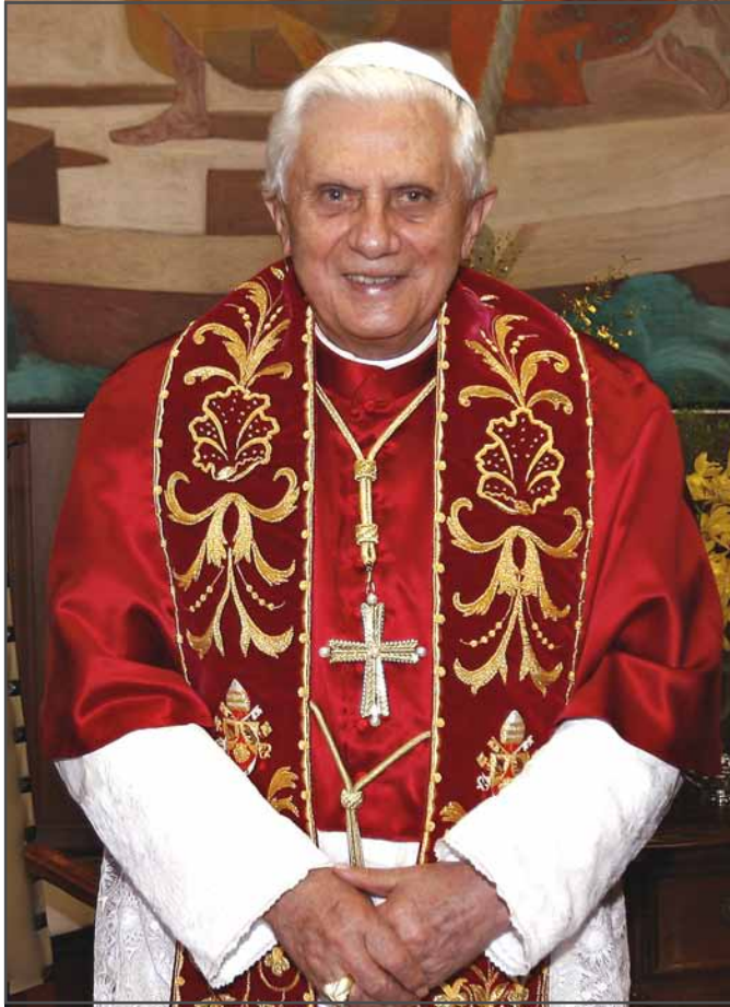
HIS HOLINESS POPE BENEDICT XVI