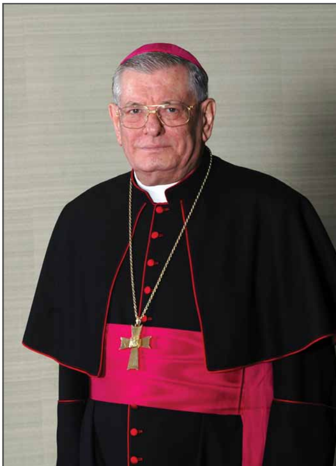
HIS EXCELLENCY THE MOST REVEREND PIETRO SAMBI, J.C.D., S.T.D. Apostolic Nuncio to the United States of America